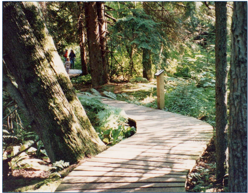
West Hylebos: Boardwalk will be restored to new condition, as seen in this original photo.